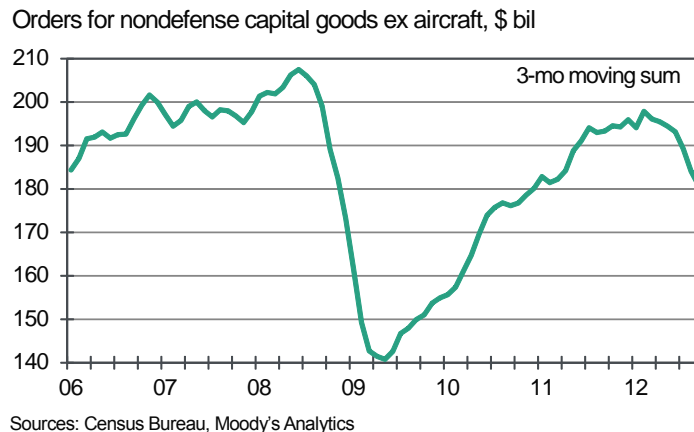
Chart 1: Nervous Businesses Pull Back

More important, businesses are simply unsure what lawmakers will do. Executives and planners cannot construct a plausible narrative of how the president and House Republicans will address fiscal issues. Business managers also know that if lawmakers botch the job, the economy will fall back into recession. Unable to handicap such a possibility, firms feel safer postponing risky investments.